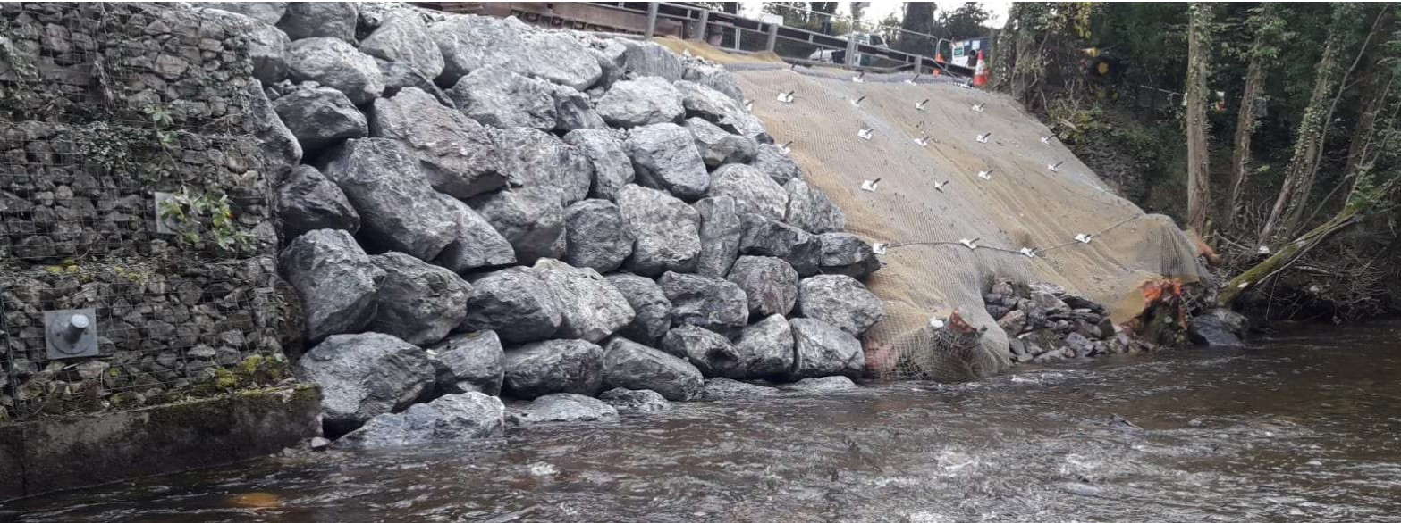
Pictured above: Panoramic showing reinstated riverbank, with soil nailing, mesh and rip rap.